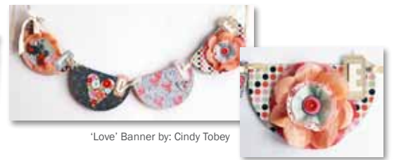
'Love' Banner by: Cindy Tobey

mailing address: 2441 N. main st. #8 sunset, UT 84015 p 801.779.3212 f 801.728.9261