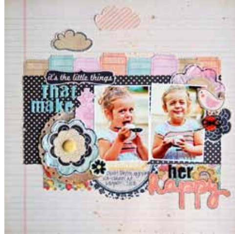
Layout: Brenda Hurd