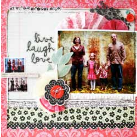
Layout: Amy Peterman