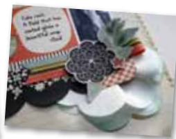
'ITLT layout' by: Cindy Tobey