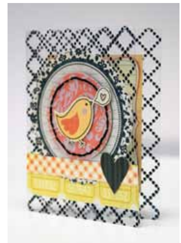
Card: Pamela Young