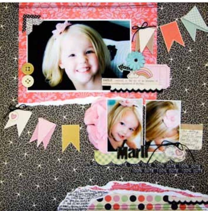
'Marli 100% Cute' by: Jodi Sanford