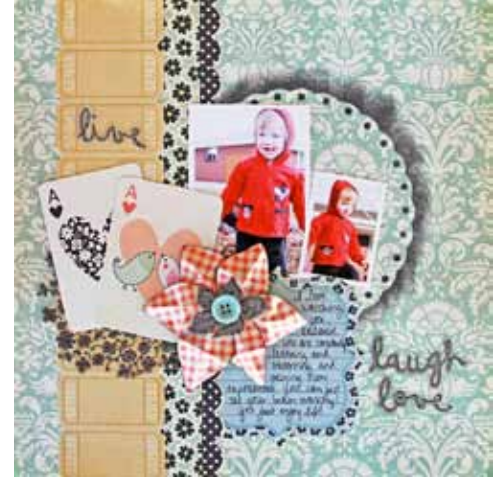
Layout: Pamela Young