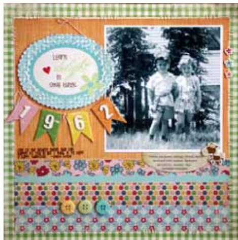
Layout: Vicki Chrisman