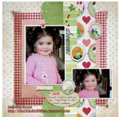
Layout: Jing-Jing Nickel