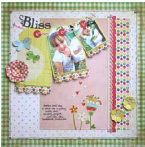
Layout: Sarah Mullanix