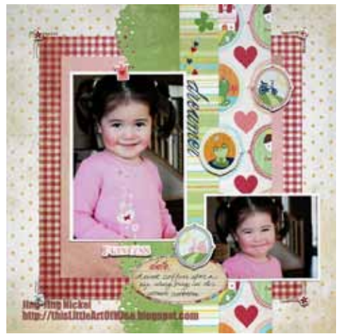
Layout: Jing-Jing Nickel