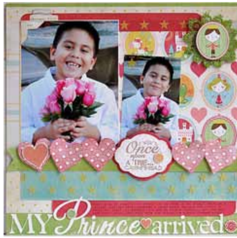
Layout: Suzanne Sergi