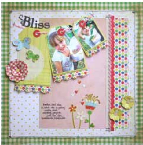
Layout: Sarah Mullanix