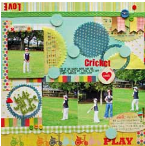
Layout: Yuki Shimada