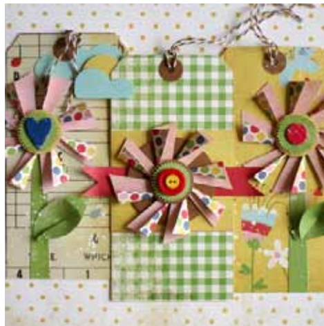
Tags: Piradee Talvanna