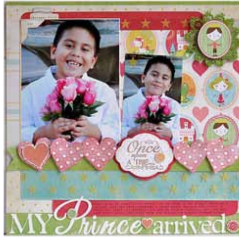
Layout: Suzanne Sergi